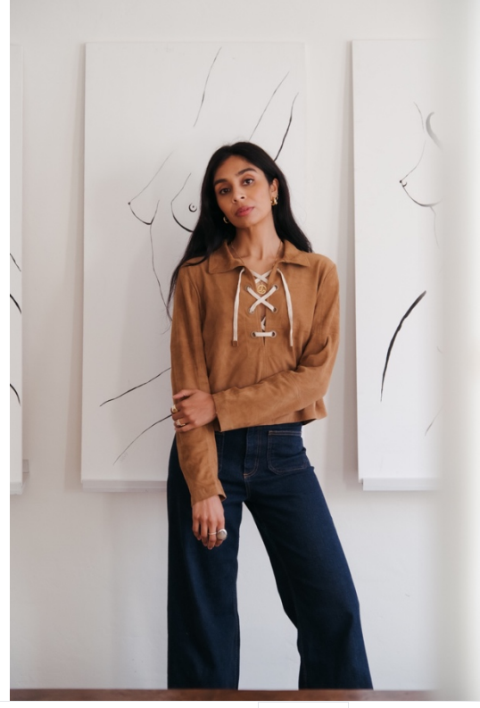
Shivy is wearing FINAZ blouse.

challenging, as sometimes those creative waves emerge at inconvenient times, and I am unable to fulfill that impulse, such as when my toddler is unexpectedly home sick. I don't have a family support system to step in and help. My husband's role is less flexible, so it's really on me to prioritize painting during the set hours my son is at preschool and to be a dedicated and loving mum when he is home. I think the societal pressure to be both an ideal caregiver and a successful professional is a struggle, as people don't always realize what you're physically, emotionally, and mentally juggling on a daily basis. These challenges, though difficult, have also made me more determined to carve out a place where my voice and art are seen and valued even more.