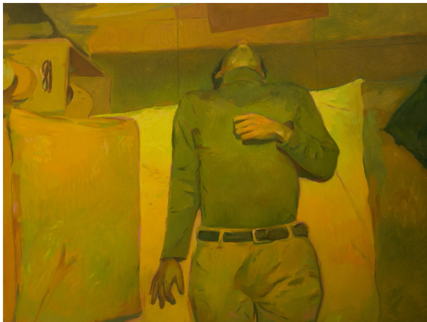
Shamir Iqtidar, Lament , 2025 Oil on canvas. 30 x 40 inches

An exhibition exploring how style, fantasy, and a heightened sense of atmosphere can also reveal profound emotional truths